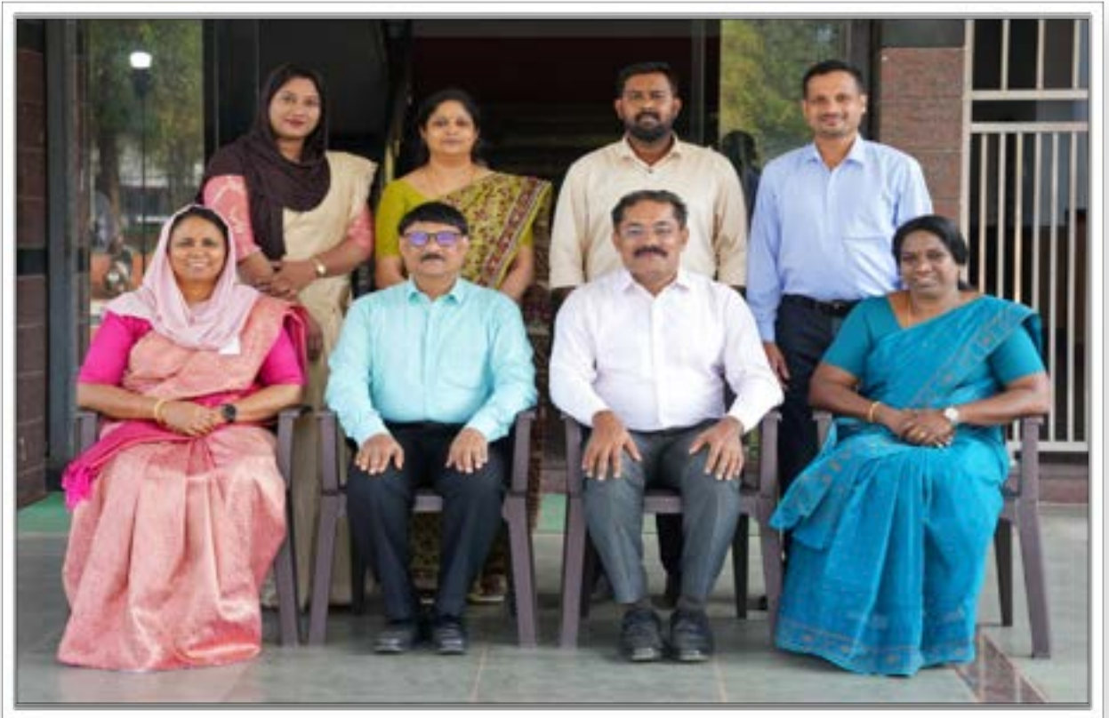
OUR MBA TEAM