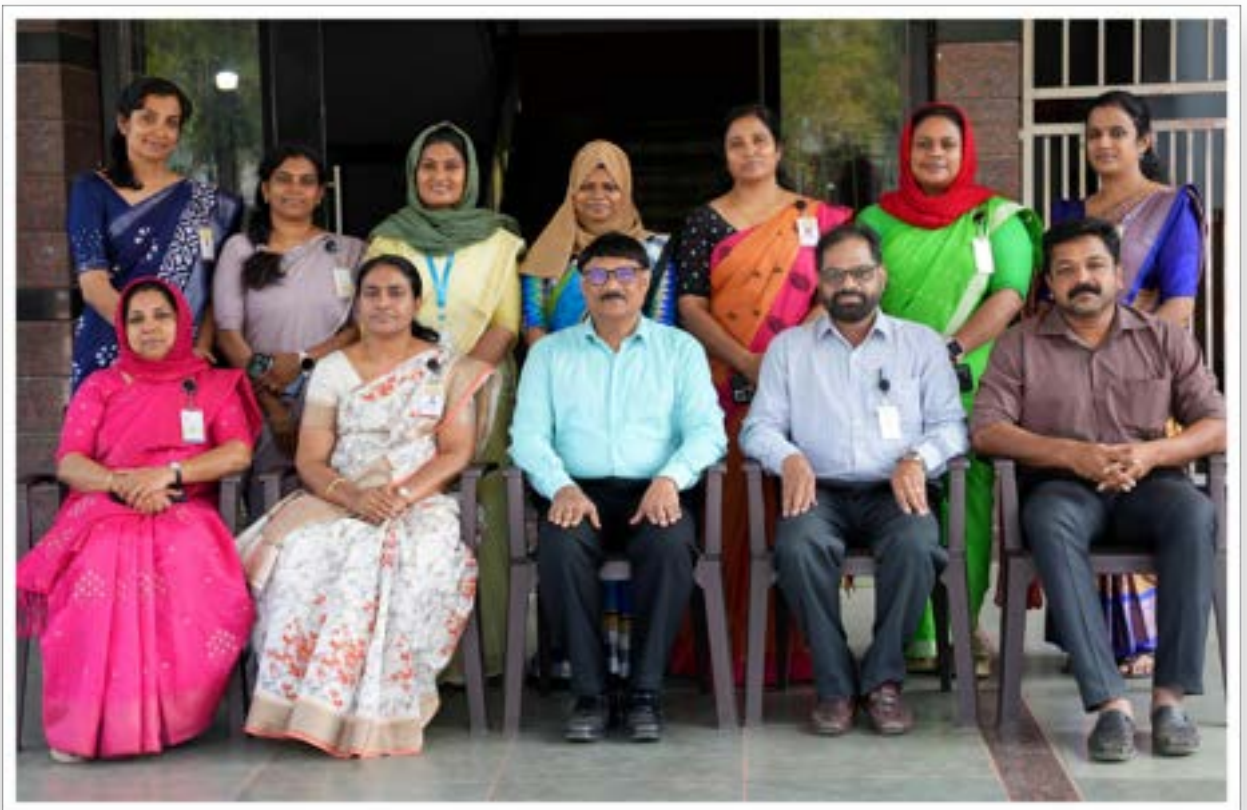
OUR MCA TEAM