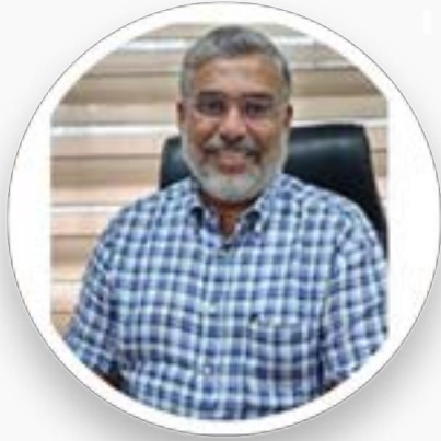
Jb T.M. Zakir Hussain